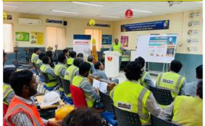
Mine Manager explaining the New Labour code to Mine Employees