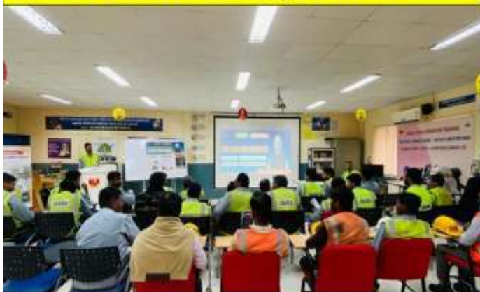
Introduction about New Labour code to Mine Employees