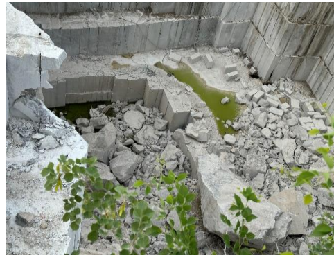
Place of accident