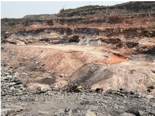
Photograph showing the site of accident