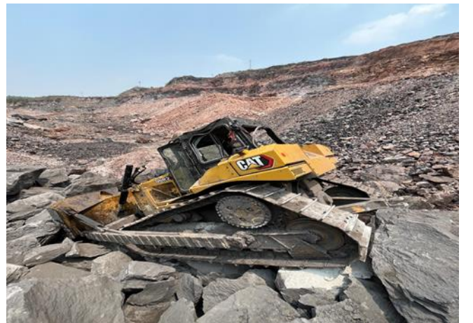
Photograph showing the Dozer at the site of accident